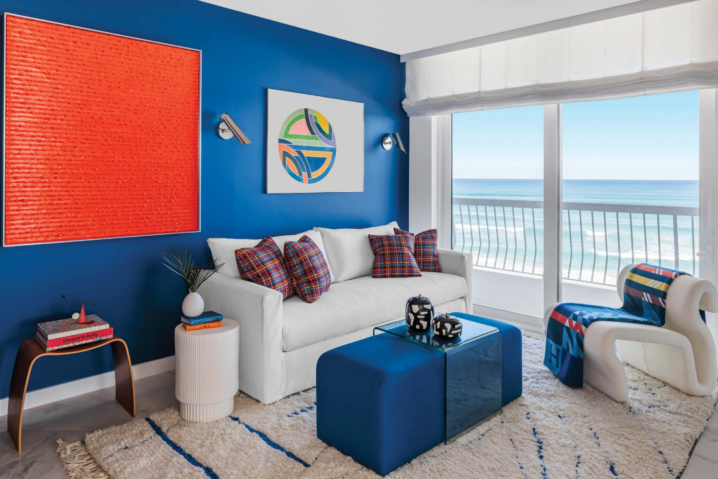
LEFT: The den's deep cobalt blue accent wall creates a dramatic backdrop for a colorfully graphic 1970s Frank Stella work and a dynamic orange painting by John Noestheden. A vibrant blue ottoman from C & G Custom Interiors counterbalances crisp white seating pieces and a plush Moroccan rug.