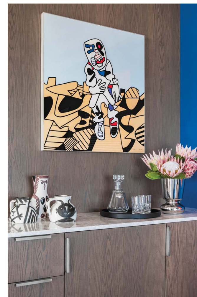
BELOW: A custom-designed wall of cabinetry in the den includes a wet bar with a terrazzo stone surface that lends a polished aesthetic. Whimsical Picasso pottery mixes with a contemporary 1970s painting by Jean Dubuffet.

husband's family and, more recently, by the clients themselves," says Suvalsky. "I was asked to create a perfect home—first for the art and secondly for the clients. Each design choice was preceded by a question: 'Where will the art go so it can help us tell the most compelling story?'"